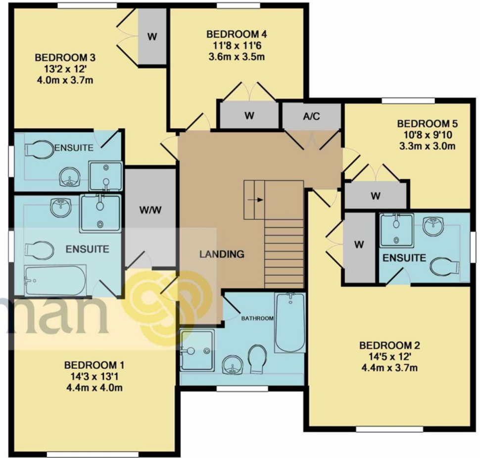
1ST FLOOR APPROX. FLOOR AREA 1266 SQ.FT. (117.6 SQ.M.)

TOTAL APPROX. FLOOR AREA 2571 SQ.FT. (238.8 SQ.M.)